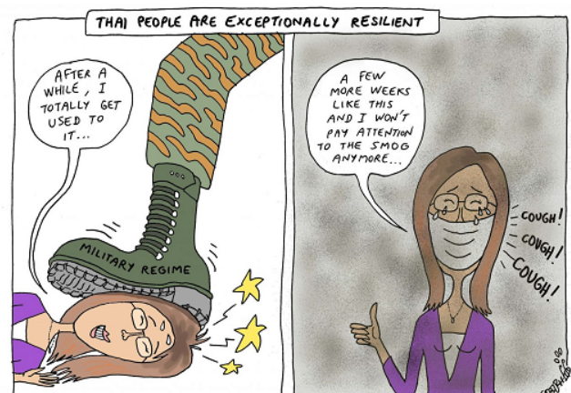
The Nation 17 January 2019

本誌は不定期で発行する予定です。配信ご不要の方は、お手数をお掛けしますが、下記連絡先あてご連絡ください。