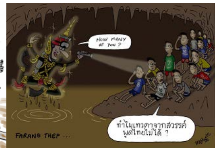
The Nation 4 July 2018