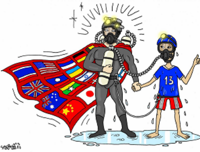
The Nation 11 July 2018