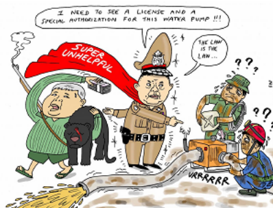
The Nation 3 July 2018